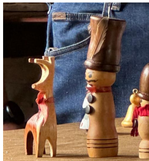
Some of the excellent decorations