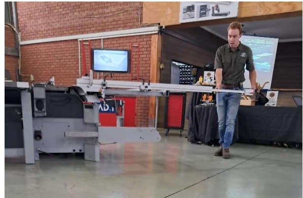
Impressive 1.3 m extension carriage