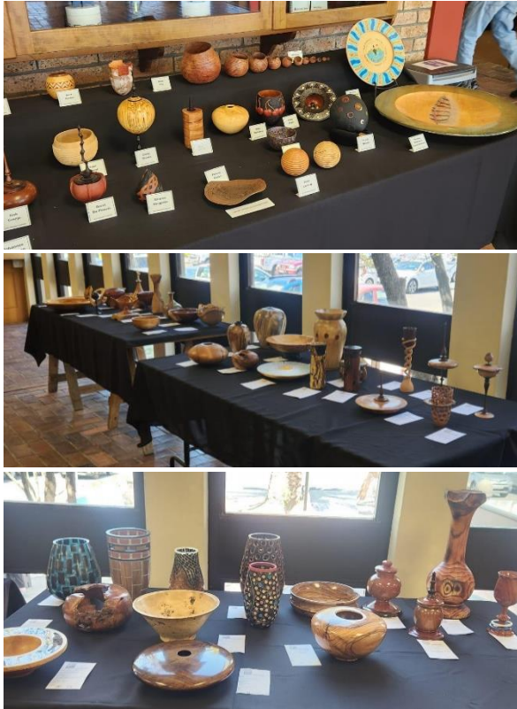
Various art pieces on display