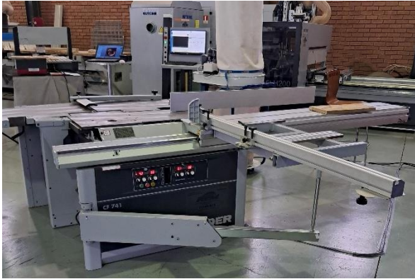
The impressive Felder CF741 combination machine