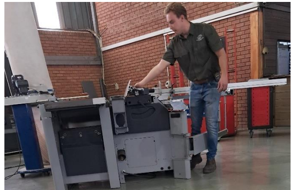
Set-up for mitre cuts