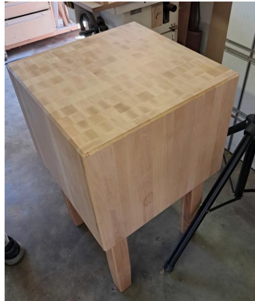
Peter's beech butcher's block

Pieter also recently completed a butcher's block made from beech. While this project used new timber, the process of sawing, accurate planning, and gluing closely followed the method used for his table. The legs were installed separately, and the final piece weighed 110 kg. In addition, several planks made from off-cut pieces are being prepared in his workshop to be crafted into kitchen cutting boards.