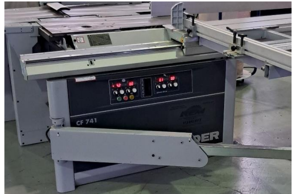
Felder CF741 Control Panel

Additional photographs feature the Felder CF741 machine, its control panel with an impressive extension arm, and the setup for making mitre cuts.