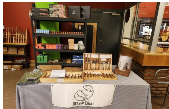
Various stalls selling turning essentials