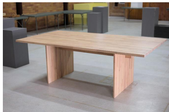
Peter's innovative laminated table