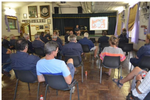
Attendees at the meeting