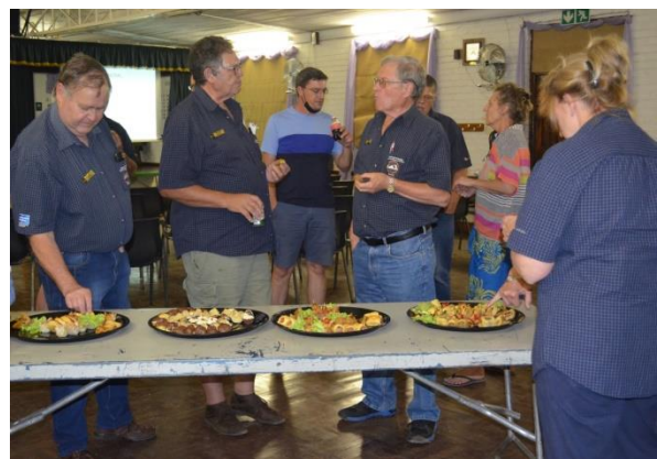
Refreshments after the meeting

The meeting ended at 19h10 and members had an enjoyable time thereafter with woodworking colleagues and consuming the refreshments.