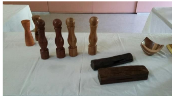
Pepper mills and knife boxes by Willem Nordeje