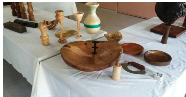
Platter with “bowtie” joint Lou Coetzer and Oluo knife by Leon Wolmarans