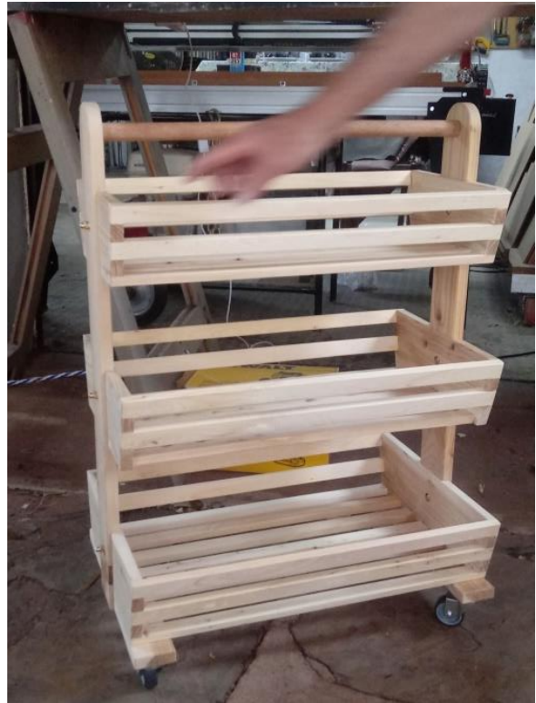
Michiel van den Berg built this wooden vegetable rack from 'scrap' wood.