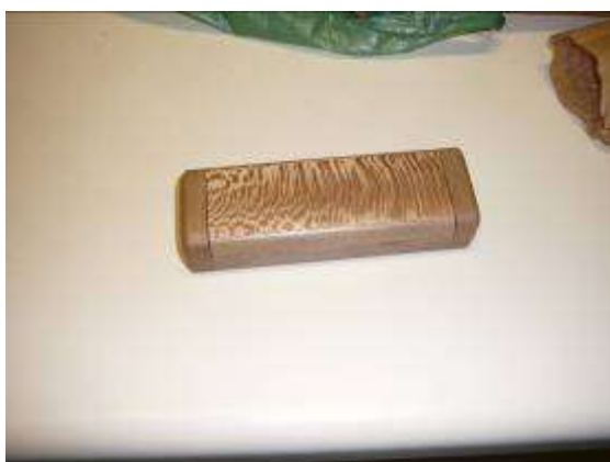
Look at the excellent use of beautiful grain pattern when making this box.