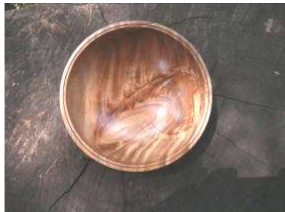
A shallow bowl, with a beautiful grain pattern