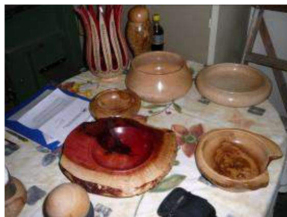
More balls and real artistic pieces