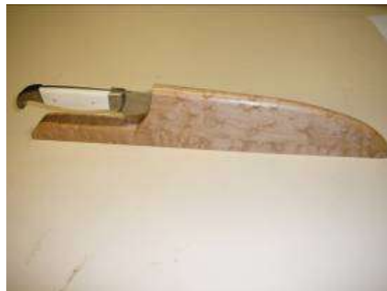
A very presentable (and sellable) carving knife.