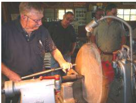
At Smit demonstreer hoe om 'n groot stuk te begin.

Herewith a few examples of the turners' homework for the period under discussion: