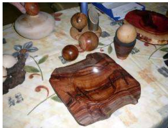
Balls and bowls to chose from