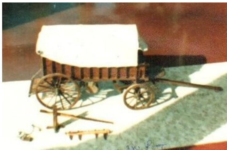
Model ox wagon